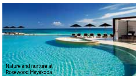
Nature and nurture at Rosewood Mayakoba