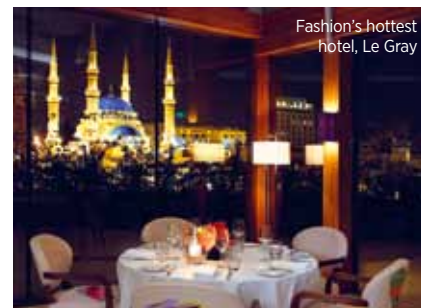
Fashion's hottest hotel, Le Gray

With pop-up stores the new-fashion fad of this decade, Dior is continuing its exclusive seven-city pop-up project at Maxfield on Melrose Avenue, Los Angeles on March 15, celebrating Raf Simons' first ready-to-wear collection for the French maison. Expect an A-list launch party, special window displays, exclusive pieces and a queue as far as the eye can see.