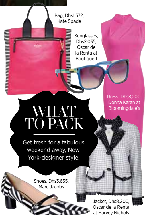
Bag, Dhs1,572, Kate Spade

A luxury boutique hotel where the fast-fashion flock and 20th century art from the likes of Andy Warhol, Damien Hirst and Julian Schnabel line the walls. We love the Gramercy Terrace and Garden, which is the five star semi-alfresco equivalent to a picnic in Central Park. From Dhs1,285 a night; Gramercyparkhotel.com