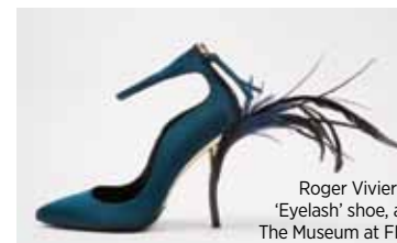
Roger Vivier's 'Eyelash' shoe, at The Museum at FIT

Get your culture fix in New York this month, with Shoe Obsession at The Museum at FIT ( Fitnyc.edu ) until April 13, which looks at our culture's