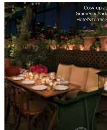
Cosy-up at Gramercy Park Hotel's terrace

This daring hotel is eye-catching inside and out, with each of its 14 floors dedicated to local and emerging artist. But it's not just about curated artworks, the award-winning David Burke Kitchen is the restaurant for those who like to eat in all the right places. From Dhs977 a night; Jameshotels.com/newyork