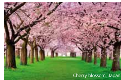
Cherry blossom, Japan

Bali , for the peace of mind and inspiration it gives me. And Italy , for the sights, sounds, tastes and beyond.