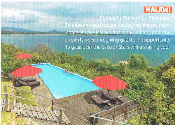
ROBIN POPE SAFARIS

This luxury beach lodge, located on the southern coast of Lake Malawi, has a new infinity pool, the property's second, giving guests the opportunity to gaze over the Lake of Stars while staying cool.